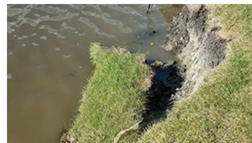
(Earlier photo of a section of shoreline breaking off and falling into pond)

With the benefit of the 2022 special assessment of $50.00, The Board has successfully completed the project to abate the disappearing shoreline around Twin Lakes. With the installation of "riprap" along the shoreline, the erosion should be at least slowed down, if not eliminated for years to come. I think we can all agree the shoreline looks much more agreeable than the sight of chunks of shoreline falling into the lake. This repair should also help the effectiveness of the lake as a water retention area. Thanks to all residents for their understanding and support of this unusual assessment.